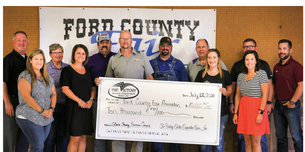
Victory presented the Ford County Fair Association with a Sharing Success grant to help repair and modernize the fair facilities.

business meetings and funeral dinners just to name a few.