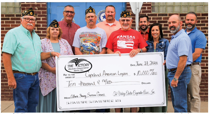
Copeland American Legion members accept the 2022 Victory Electric and CoBank Sharing Success grant.

The legion plans to upgrade their building using the granted funds. The legion membership believes repairs will be a huge benefit to the community, which uses the building for family dinners, reunions, graduation and wedding parties, land sales.