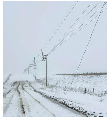
High winds and wet snow on March 19 led to more than 8,000 outages in Victory Electric's service area.