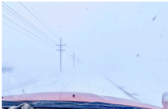
Victory Electric crews faced challenging weather and road conditions.