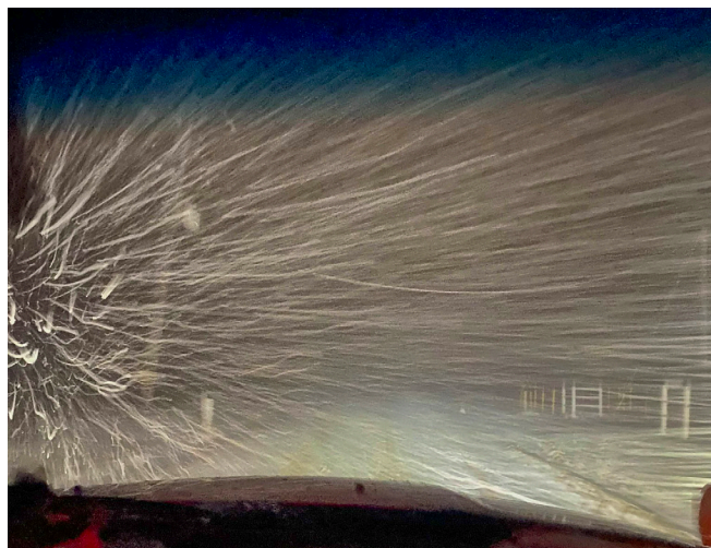
Winter weather blasted the region with blizzard conditions and high winds, causing many outages March 19.