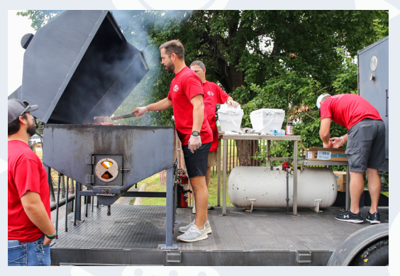
ABOVE: Victory employees grill burgers for guests at the hamburger feed.

In July, Victory joined in the DODGE CITY DAYS PARADE to help celebrate Kansas' second-largest community festival. This 10-day celebration honors Dodge City's rich history and western heritage complete with a cattle drive through town and events for the whole family. The festival draws local community members and visitors from both near and far.