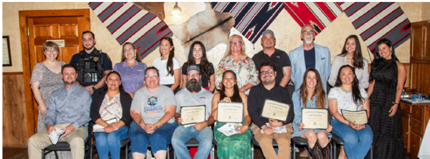
The 2025 cohort of Leadership Dodge graduated in June.