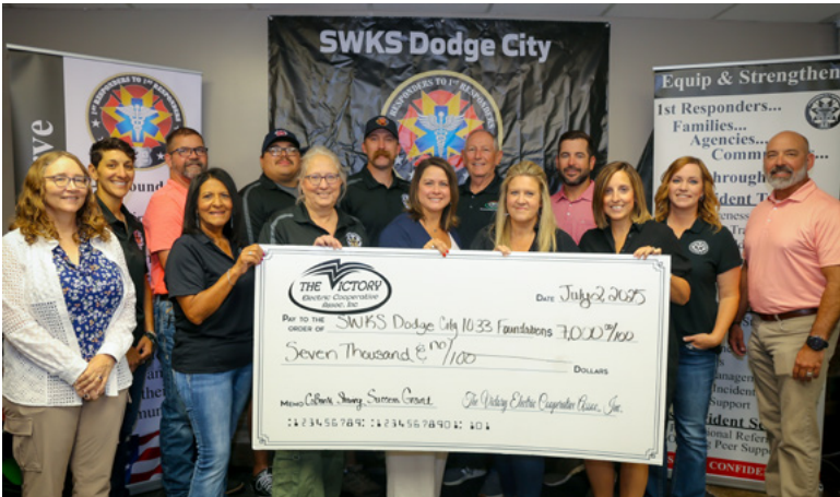
The Southwest Kansas-Dodge City 10-33 Foundation received a $7,000 CoBank Sharing Success grant to provide crisis support and training for first responders.