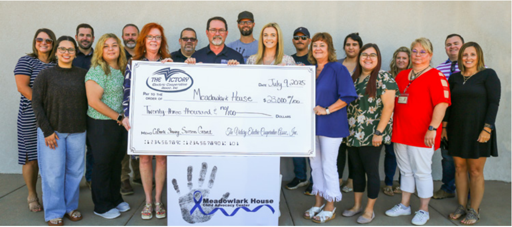
Meadowlark House Child Advocacy Center received a $23,000 grant for a case management platform for conducting secure forensic interviews and coordinating support and advocacy services it and other agencies provide to abused children.

There is a pressing need for Meadowlark House's services. In 2023 and 2024, the organization served 133 children across nine counties. The grant will enable Meadowlark House to