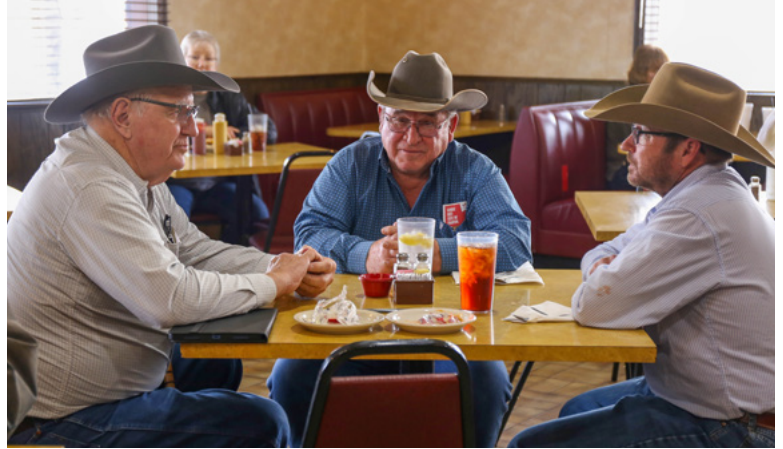
Members have lunch at the Blue Hereford in Ford, Kansas, during a member appreciation pop-up event.

Victory Electric sponsored a member appreciation pop-up event at the Blue Hereford restaurant in Ford in February. We bought lunch for members and had drawings for bill credits, a gift basket and a valentine bundle.