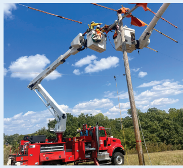
Victory linemen learned the proper procedures for positioning, covering up, changing layouts and switching out structures when working with live lines.