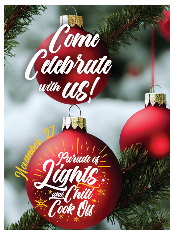
FIND OUT MORE!

The planning committee for the 2023 Dodge City Christmas Parade of Lights