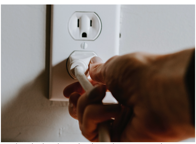
Avoid overloading electrical outlets and power strips. When overloaded with electrical items, outlets and power strips can overheat and catch fire.