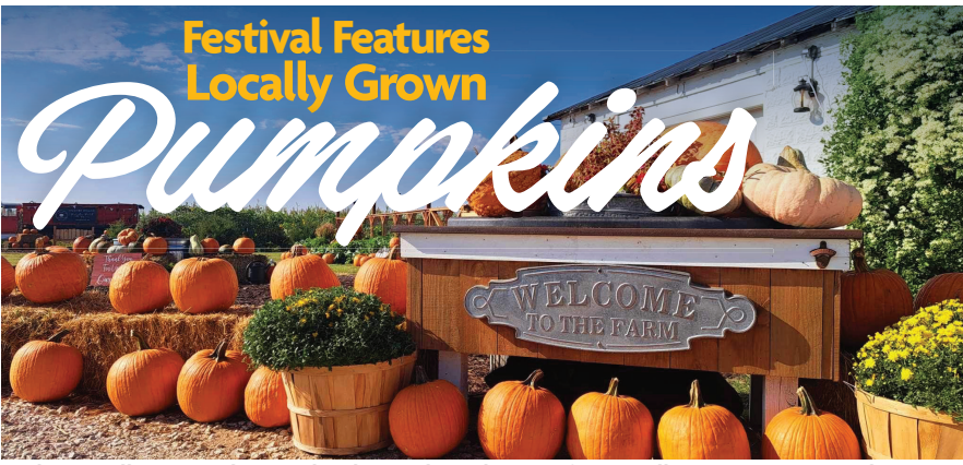
Hickory Hollow Pumpkin Patch is located southwest of Spearville, Kansas. Victory Electric members Allison and Cody Langlois started the pumpkin patch in 2021.

Employees enjoy celebrating the fall season and connecting with community members of all ages during the Pumpkin Painting Festival every October at Victory Electric. We appreciate all the volunteers from local groups who help us put on the event, which features festive fall fun with hundreds of pumpkins for children to decorate, train rides, games and other activities — plus plenty of popcorn!