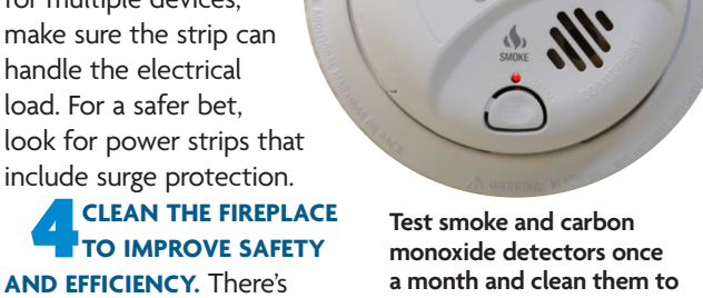
ensure the sensors are clear of dirt and debris.

Victory Electric wants you and your family to stay safe during the winter season. Visit www. victoryelectric.net/electrical-safety-tips for additional safety tips.