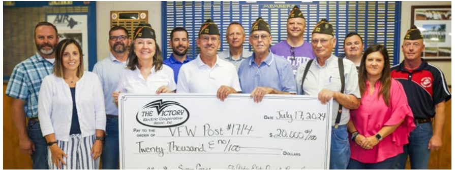
Victory Electric awarded $20,000 to the Veterans of Foreign Wars (VFW) Post 1714 as a part of their Sharing Success program.

"The VFW was founded with a singular mission: to protect