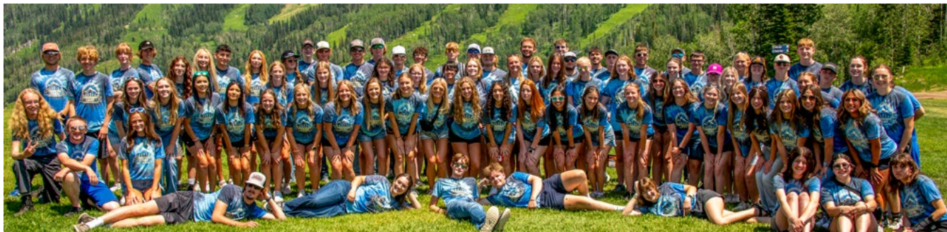
Near scenic Steamboat Springs, Colorado, CYLC brings together 79 student leaders from Kansas, Oklahoma, Colorado and Wyoming, sponsored by 44 participating electric and agriculture cooperatives.