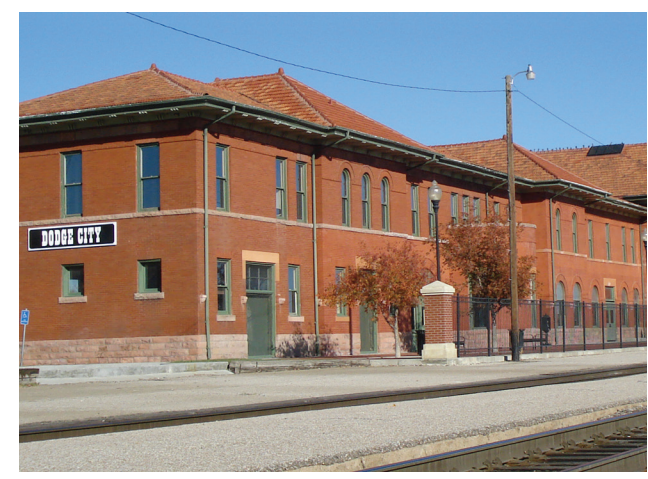
The Depot Theater, dedicated in 1898, now serves as the Depot Theater Company and is ready for an audience for the next production, showing the weekends from December 4 to the 19. Phone on the left was taken in 1898; right-hand photo taken in 2014.

For years, the DEPOT THEATER COMPANY has brought the community together for dinner and a show and they are now offering a discount with Victory Electric's co-op connections card.