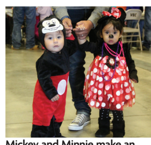
Mickey and Minnie make an appearance at the Pumpkin Festival.