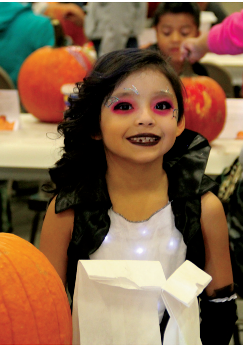
There were many colorful pumpkins. Kids even came in their halloween costumes to enjoy the event.

DECEMBER 2015 KANSAS COUNTRY LIVING 16-C