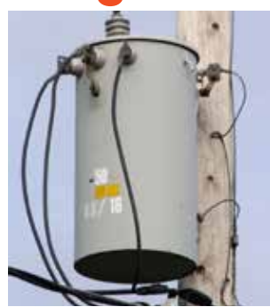
Transformers dirigiendo el trafico de la electrica.

El envío de energía a su casa se parece mucho a conducir a un estado vecino. Usted no considerara la adopción de una carretera secundaria de dos carriles que viajar a una ciudad a cientos de kilómetros de distancia, ¿verdad? Por supuesto que no: Usted encontraría la interestatal más cercana por lo que podría conducir más rápido y llegar a su