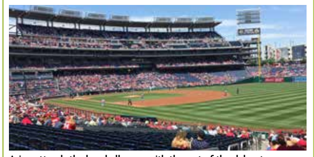
Arjon attends the baseball game with the rest of the delegates.