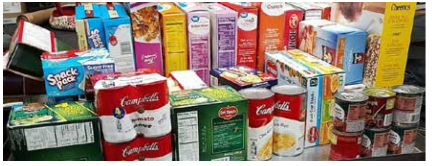
The Dodge City Fire Department donated more than 65 items to Vittles for Vets.

To view a complete list of items, visit ow.ly/OM7Q30dJdIa. If you have any questions, call the Victory Electric office.