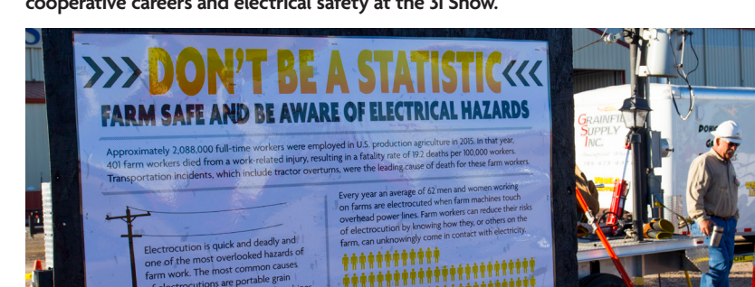
A poster displayed throughout the 3i Show shows statistics about farming safety to