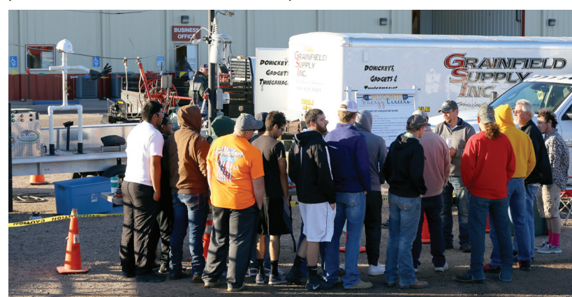
Dodge City Community College Line Program students gather to learn about cooperative careers and electrical safety at the 3i Show.

The first day of 3i included a career day for area high school and community college agricultural programs where Victory Electric gave a presentation about careers in the cooperative.