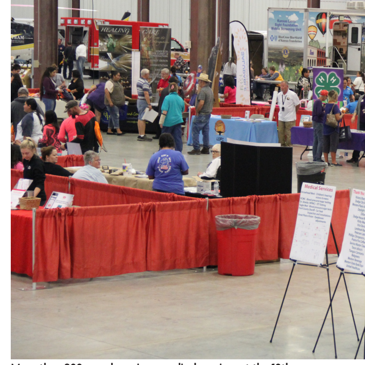
More than 800 people recieve medical services at the 10th Annual Victory Electric Community Health Fair.

16-B KANSAS COUNTRY LIVING ■ NOVEMBER 2017 ■ KANSAS COUNTRY LIVING 16-C