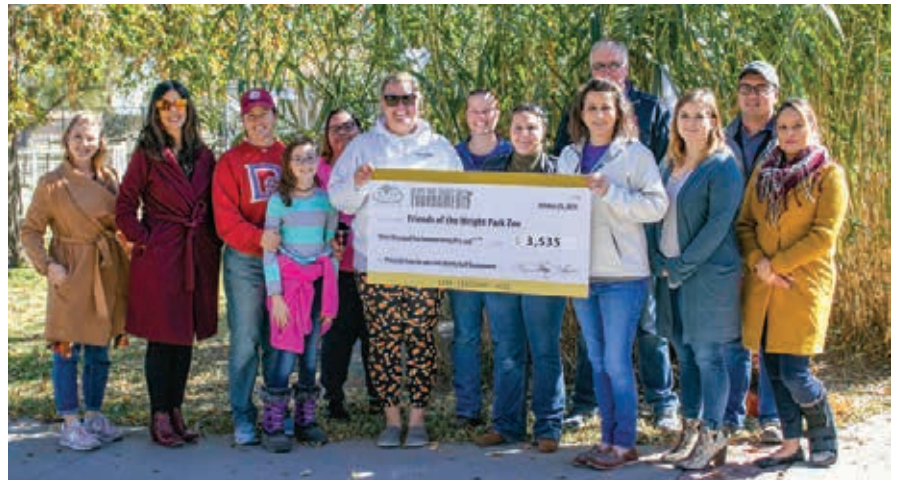
Representatives from Victory Electric, Friends of the Wright Park Zoo, City of Dodge City and zoo staff gathered for the official check presentation.

Friends of the Wright Park Zoo is raising funds for a zoo revitalization project aimed at creating a more enriching environment for the animals in the zoo's care, updating habitats, and educating the community with unique experiences. The zoo currently entertains more than 60,000 visitors per year from Dodge City, the surrounding counties,