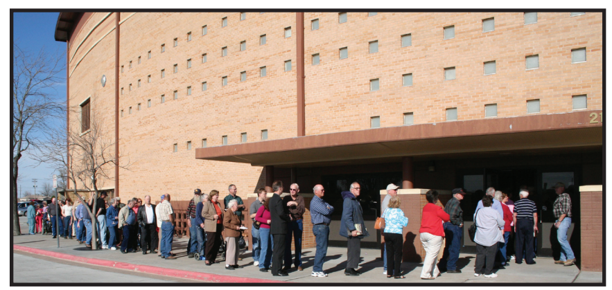
Members arrive at the Dodge City Civic Centers to attend Victory's Annual Meeting of Members. Members were served a free meal and dozens of great door prizes were given away.