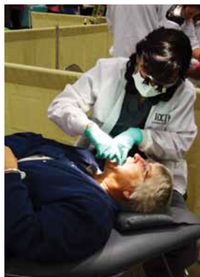
Dodge City Dental Care performs oral cancer screenings.

We would like to thank all those who assisted in the planning and organization of the event; you were an invaluable resource. Also, thank you to the 115 volunteers from the community who came out to help us keep everything running smoothly. We could not have hosted the health fair without you.