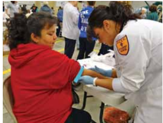
Student Nurses from Dodge City Community College helped with the blood draws.