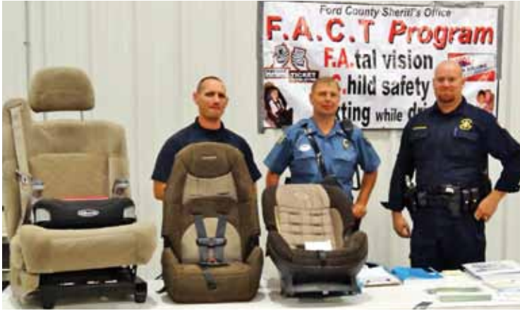
Representatives from Ford County Sheriff's Dept, Kansas Highway Patrol and Dodge City Police Dept. inspected car seats and directed the fatal vision driving course.