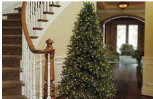
Pre-lit Christmas trees featuring Energy Smart® LED light sets use up to 80 percent less energy and last longer.

decorators who like to blanket their entire house and yard in holiday lights, LEDs could save hours of painstaking work each year.