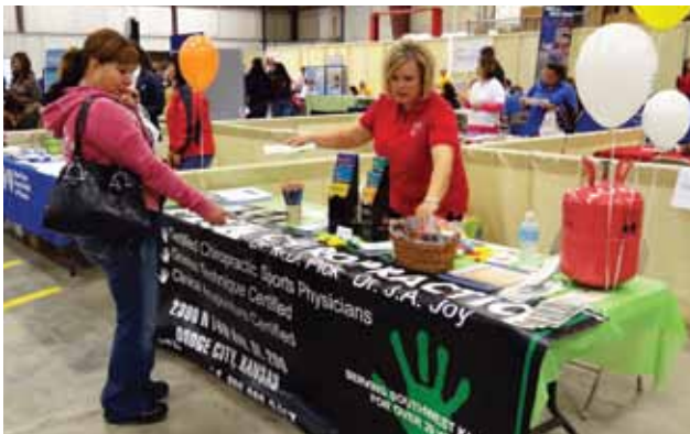
Pick Chiropractic hands out information on their services