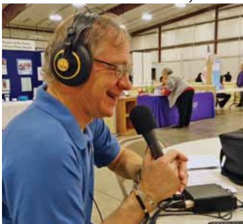
Rocking M Radio hosted a live remote from the health fair.

fair included free eye auto-refraction screenings, blood pressure checks, skin cancer screenings, pap smears, prostate exams, oral cancer screenings, spinal screenings, car seat safety inspections, massages, hearing tests, $15 flu shots, $10 complete blood screens and $35 whooping cough vaccinations.