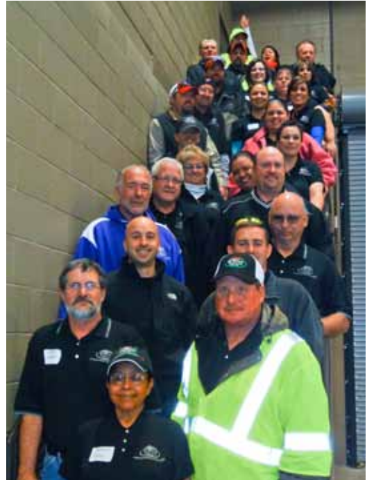
Victory Electric volunteers helped facilitate the Health Fair activities.