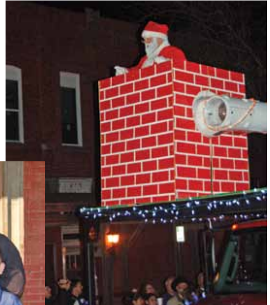
Above: Santa makes an appearance in the parade each year in a Victory bucket truck.