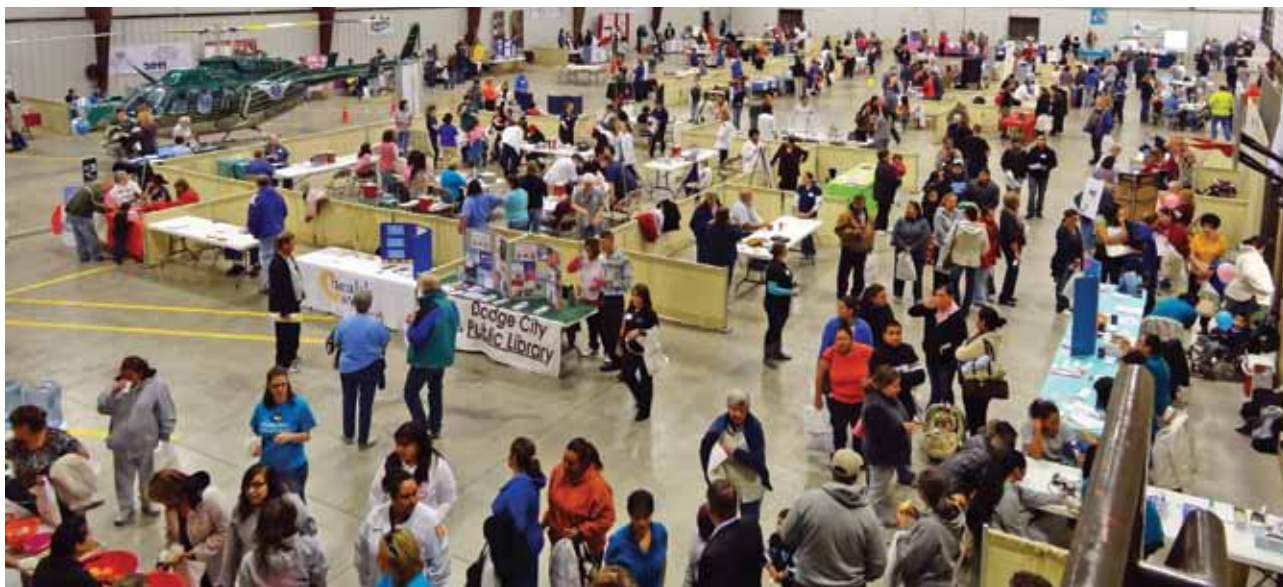
Health care providers and volunteers were essential to the success of the Victory Electric Community Health Fair on October 6.

Hundreds attend health fair for free services