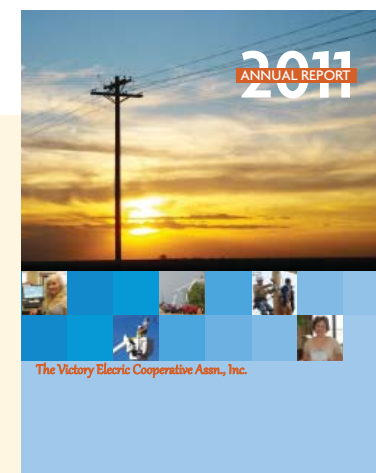
The Annual Report contains ballots for the Board of Trustees election.

While on the board there were a lot of tough decisions made. Most of them involved basic business and common sense. I have and would again bring that to every meeting. Thanks for your support.