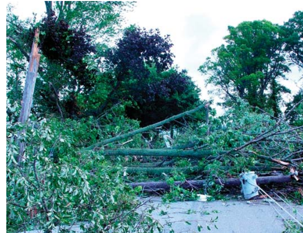
Una tormenta no solo derriba árboles, sino que también puede reducir las líneas eléctricas. Trate a cada cable de electricidad caído como si estuviera todavía con electricidad, usted no será capaz de decir si es en directo.

Para más información, visite SafeElectricity.org