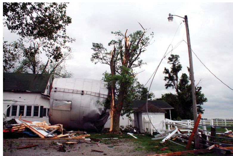
Storms leave a variety of safety hazards behind them – from downed power lines to fragile buildings. Be aware of your surroundings as you re-enter your home or property after a storm.

For additional information, tips and safety videos, visit SafeElectricity.org .