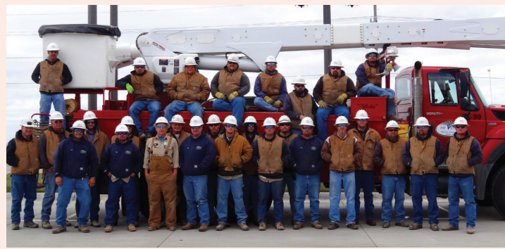
Victory Electric thanks our linemen who keep the power on.

to thank a lineman for the work they do. Use #ThankALineman to show your support for the men and women who light our lives.