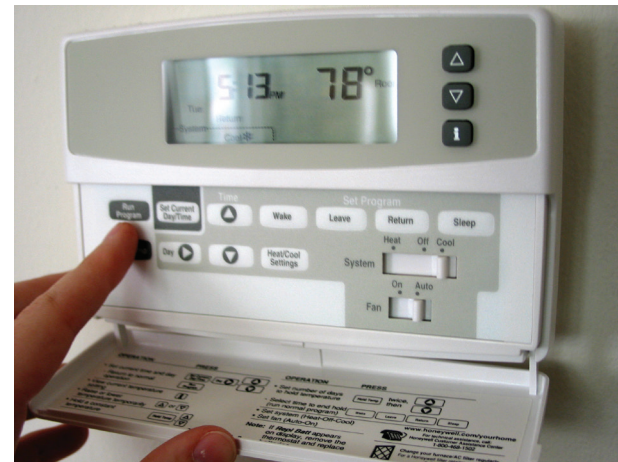
El termostato programado ofrece cuatro periodos de programación: despertar, salir, retorno y dormir.

En promedio, esperan ahorrar alrededor del 10 por ciento anual de su factura de calefacción. El tamaño del cambio de temperatura cuando ausente o dormido es otra área de discusión. Campamento recomienda mantener el rango estrecho sobre la teoría de que la casa pierde también mucho de su acondicionamiento y la energía ahorrada se pierde como los sistemas de trabajan para volver a la temperatura adecuada. Otro dice sistemas funcionan más eficientemente cuando está ajustado a una temperatura bastante modesta (refrigerador para la calefacción y calentador para enfriamiento) y dejen en paz. Y el último es opinión de la EPA que un cambio de 10 a 15 grados durante un periodo de ocho horas ofrece los mejores ahorros, un cambio respecto a las recomendaciones anteriores. Una advertencia ofrecida por la EPA es que usted no debe usar un termostato programable para bombas de calor. Al mismo tiempo bien en modo de enfriamiento, hacen que la bomba de calor ineficientes en modo calefacción. Termostatos diseñados específicamente están disponibles