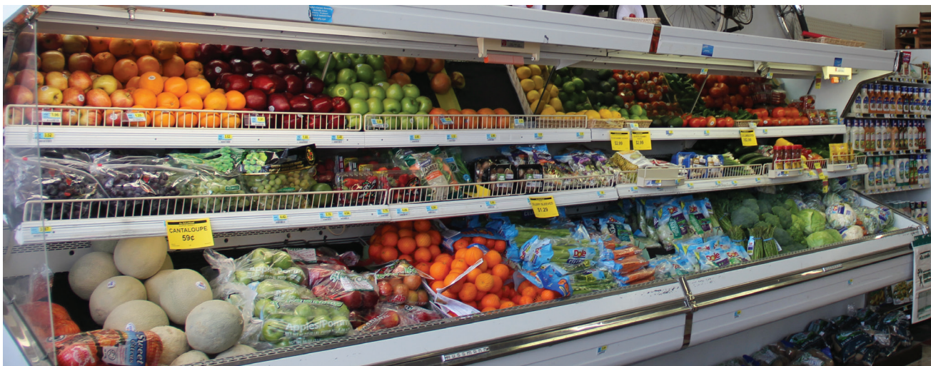
Kelly's Corner Grocery of Spearville has more than just groceries. Save with your Co-op Connections Card.

Victory Electric encourages members to take advantage of the Co-op Connections Card.