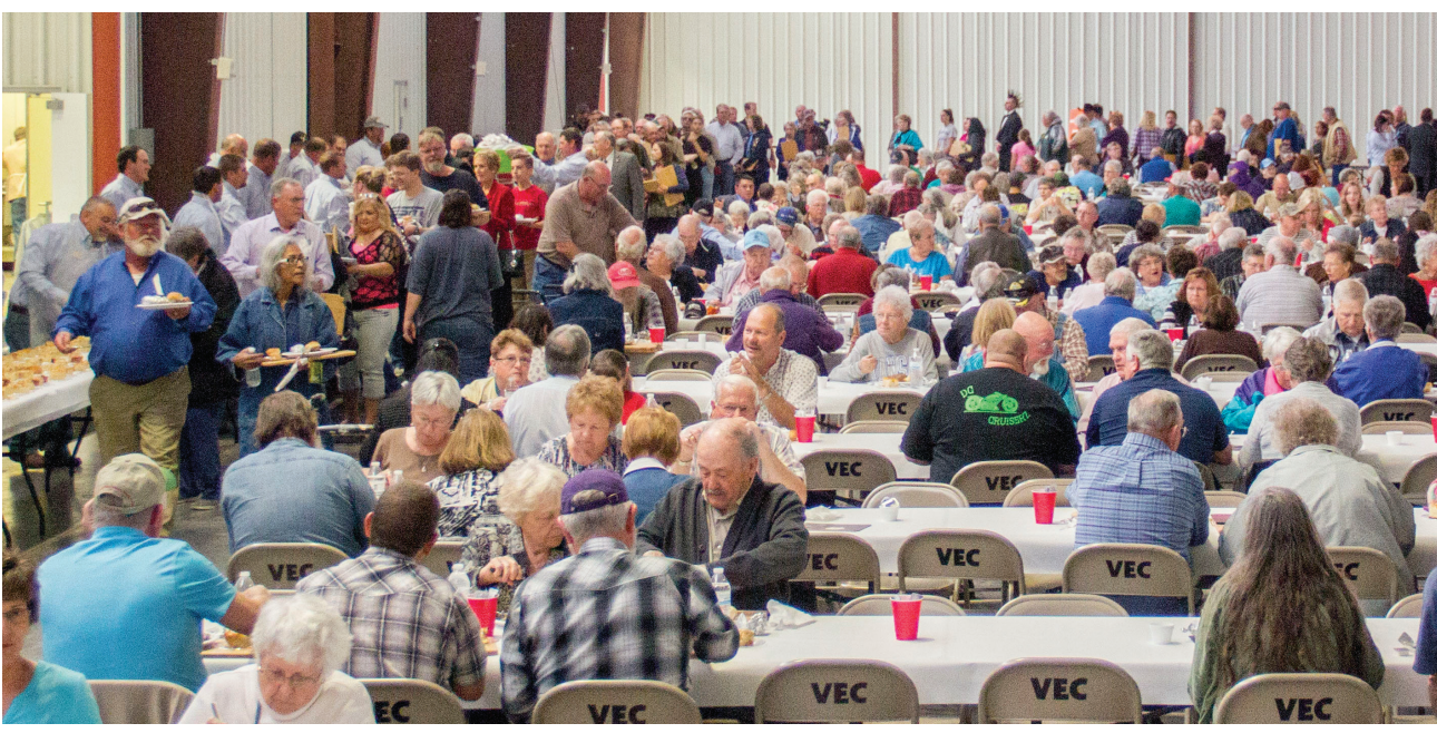
More than 750 people were served a steak dinner at the 71st Annual Meeting.

Every year, Victory Electric looks forward to hosting the annual meeting for our members, and this year was no exception. The annual meeting is a great time to get to know our members and to offer information on the activities of the cooperative.