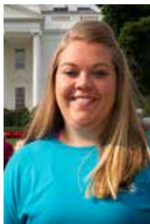
Axtell will cherish the Youth Tour trip for years to come.