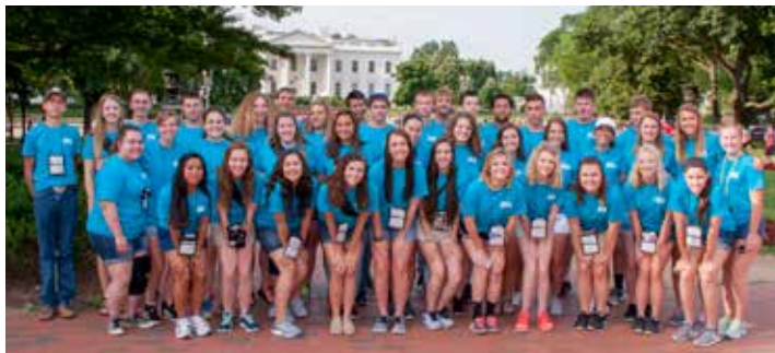
The 2016 Kansas-Hawaii delegation included 40 students who had the opportunity to see memorials including the White House on their trip to Washington, D.C. for the Youth Tour.

Victory Electric sponsors the Youth Tour each year as part of our strong commitment to the community. For more information, please visit our website.