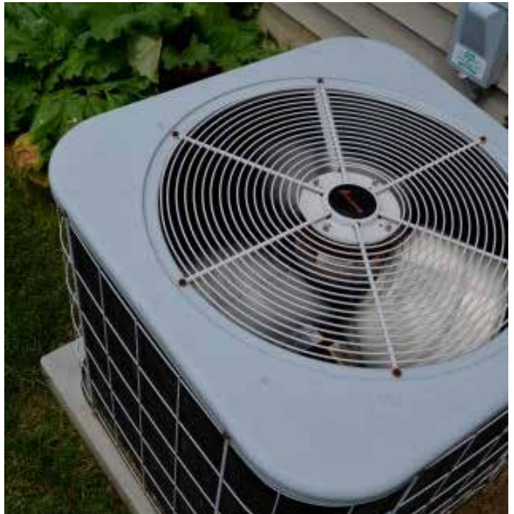
Air conditioners get more use in extreme heat. Regular maintenance can save on your energy monthly energy bill.

Your energy use is important, so do not simply ignore rising temperatures. If you have any questions on more ways to save and beat the heat and your electric bill, call the office at 620-227-2139 or visit our website at victoryelectric.net .