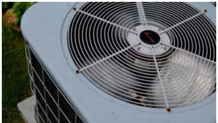
Si usted está buscando una nueva unidad de aire acondicionado, asegúrese de revisar un modelo nominal de Energy Star.

Si una nueva unidad de aire acondicionado está fuera de la cuestión, una inspección anual de rutina y mantenimiento regular de la unidad actual puede ayudar a preparar para que se ejecute de manera más eficiente durante los meses de verano. Apague la alimentación del acondicionador de aire antes de trabajar en él. Limpiar o reemplazar los filtros. En el exterior, las hojas claras y otros desechos fuera de la unidad de condensación. Manguera la suciedad acumulada.