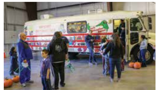
The Literacy Bus provides activities for the youth attending the Pumpkin Festival.