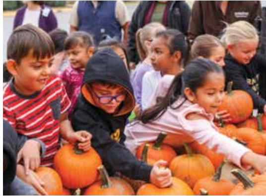
Students from Northwest Elementary choose the pumpkins they want to take home.

Victory Electric donated pumpkins to Northwest Elementary. Each student picked their own pumpkin to take home. This is one way Victory Electric likes to give back to the communities we serve. Victory Electric serves as a community partner to Northwest Elementary and donates pumpkins each year so students have the opportunity to have pumpkins for Halloween.