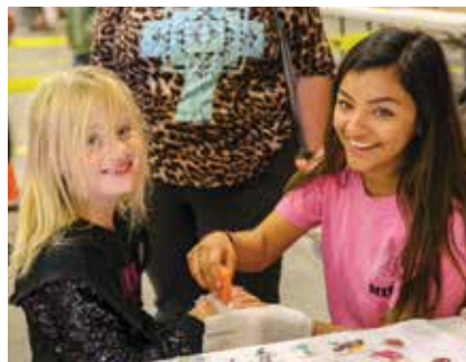
A Ladies Community Outreach member applies a temporary tattoo.