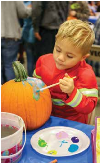
A young fireman personalizes his own pumpkin with paint.