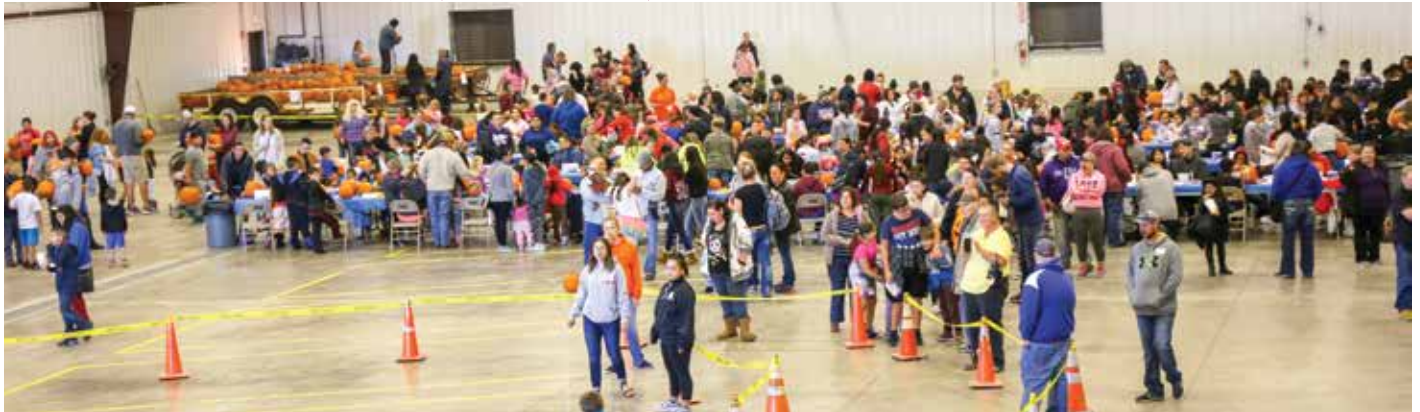
The annual Pumpkin Painting and Carving Festival was attended by more than 550 area youth and their families.

The 12th Annual Pumpkin Painting and Carving Festival was held on Oct. 26 at Victory Electric.