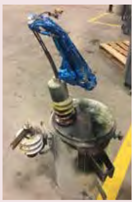
A metallic balloon landed on a transformer and caused blinks and disrupted service for members in May.

lose power, traffic lights could go out, and entire blocks of homes and businesses could