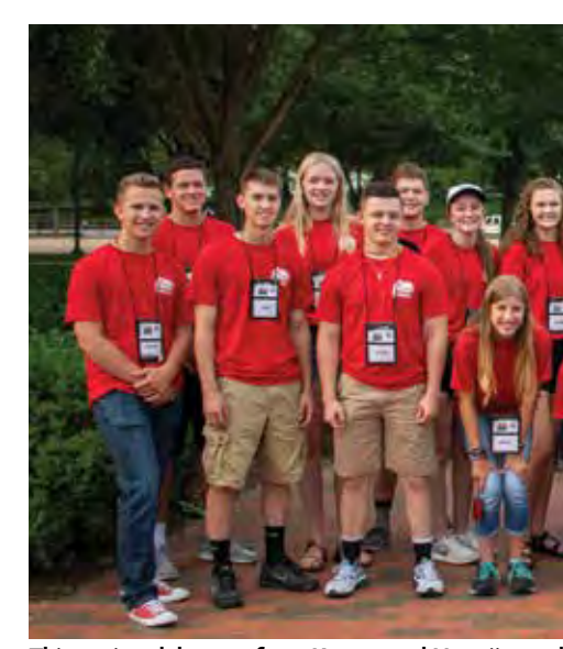
Thirty-nine delegates from Kansas and Hawaii stand

In addition to Capitol Hill, the Youth Tour stops included the Holocaust Memorial Museum, the