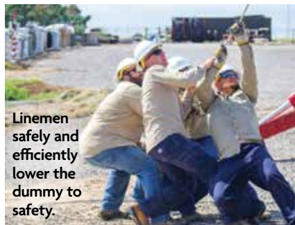
Linemen safely and efficiently lower the dummy to safety.