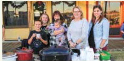
Top: Arrowhead West prepares to serve their chili.