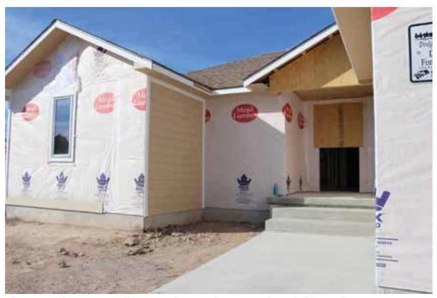
The newest home on Mulberry Circle in Dodge City is about half complete.