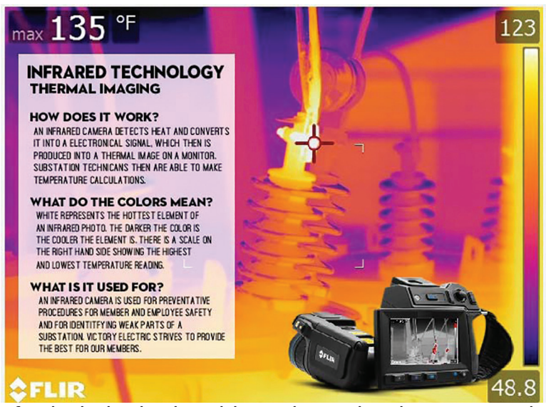
Infrared technology has changed the way electric utilities diagnose issues on the electric grid.