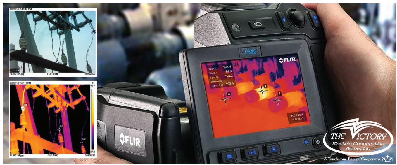
When comparing the two small photos above and to the left, the bottom photo shows a white "hot spot" connection. When comparing infared images of connections close by, the greater the temperature difference the quicker we act to resolve the issue.

Sir William Herschel, royal astronomer to King George III of England, discovered infrared technology in the 1800s. Fast forward to 1978, FLIR was founded as an infrared imaging systems provider for energy providers such as Victory Electric. Thermal imaging tools are used for many different purposes in industries such as security, transportation, government organizations, and more.